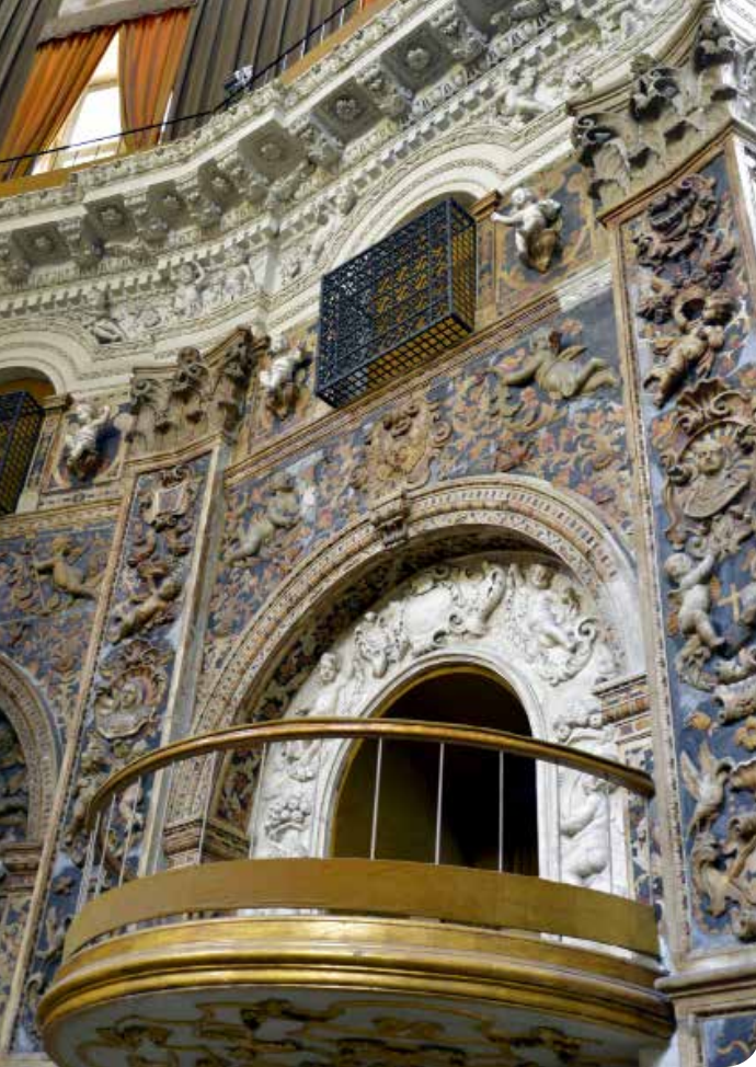
40 Palermo, Church of the Santissimo Salvatore. Interior