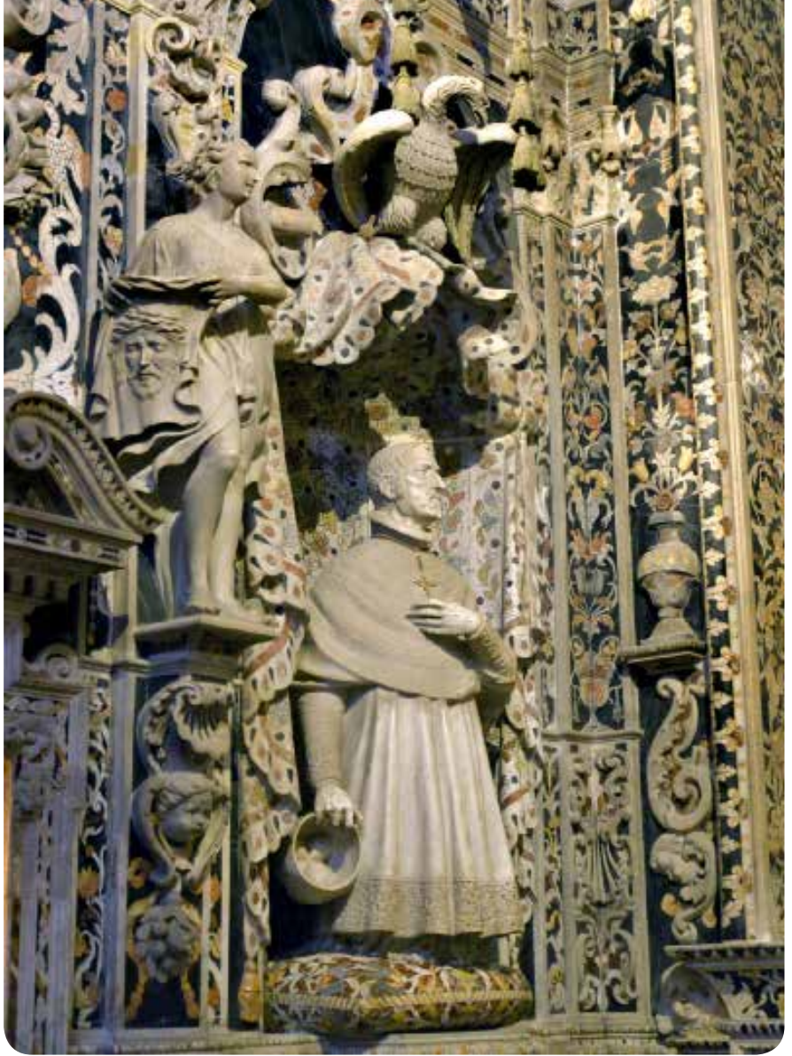
49 Monreale, Cathedral, Chapel of the Crucifix. The Archbishop Roano in prayer

All the decorative motifs recall the Crucifix and Christ's ultimate sacrifice in a complex symbology.