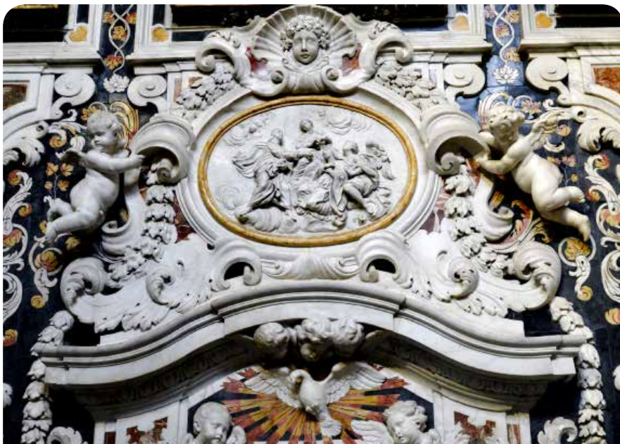
37 Palermo, “Grand Chapel” of the Martorana. Detail

The decoration of the Grand Chapel is connected to the celebration of the Benedictine Order.