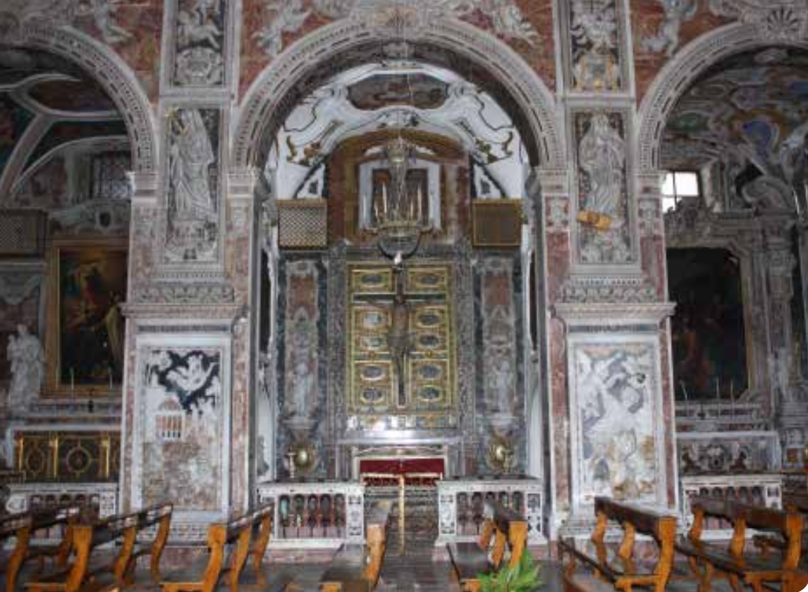
27 Palermo, Church of Santa Caterina. Right aisle