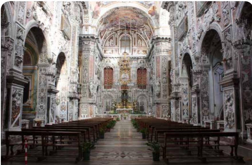
26 Palermo, Church of Santa Caterina. Interior

the lower social groups, accepted only as converts. In the uninterrupted flow of inlays and sculptural elements, it is easy to perceive the Baroque sense of religion as pomp, celebration, luxury, and a political machine. Available documents suggest that the marble facings of Santa Caterina were initiated between the 17 th and the 18 th century, with the pilasters of the groined vault and lasted more than three decades. The decoration is played out mainly in the usual colours of the black and red backgrounds together with the white of the sculptural inserts. Its significance can be attributed to the glorification of Santa Caterina and the Dominican Order. The basement plinths are particularly visible along the nave, divided from the upper area by cornices, which were made at different times. On the left side, the first depicts a fountain, with representations of Marian attributes, on the following two that conversely flank