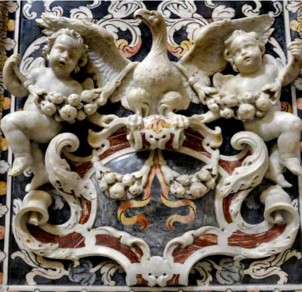
1 Palermo, Church of the Martorana. Detail