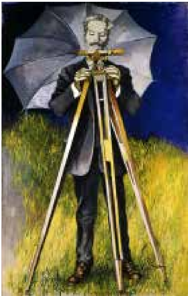
Guttuso by SIAE