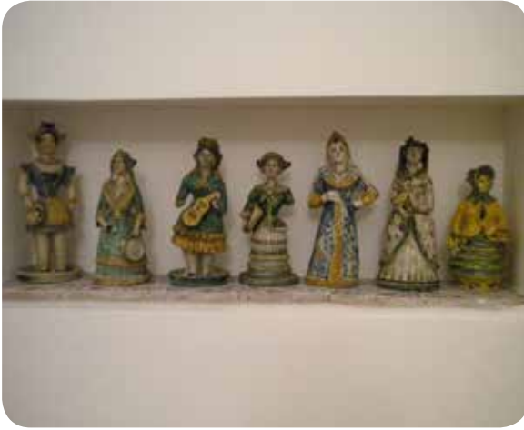
63 Anthropomorphic lamp, 19 th century, made in Caltagirone