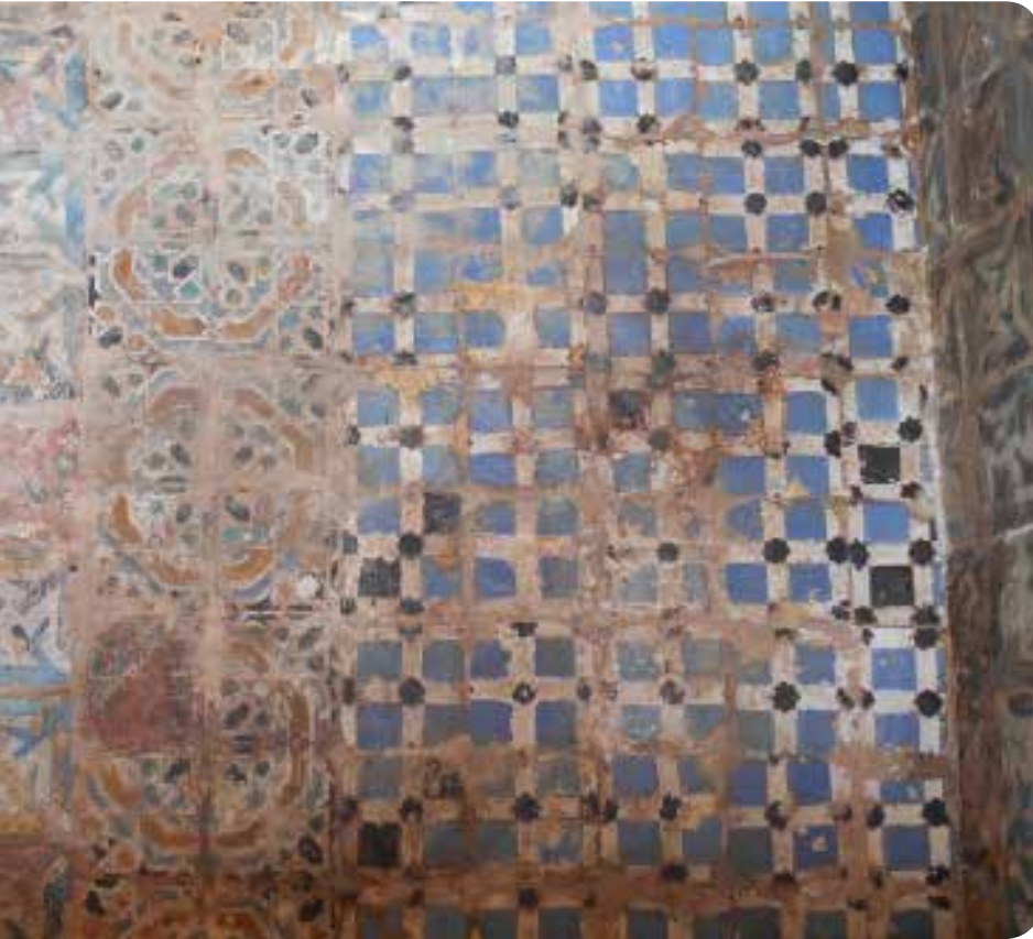
4 Palermo, Zisa. Azulejos, ceramics, 16 th century, Spanish.

Populusque Panormitanus ), enveloping the backs of albarelli [i.e., apothecary jars] and bowls ( fig. 7 ). The Palermo workshops are very active throughout the 18 th century, producing a quantity of polychrome floors with extensive designs, based on projects drawn up by excellent architects for churches, oratories, palazzi and villas. Three entrepreneurial experiences from the end of the century