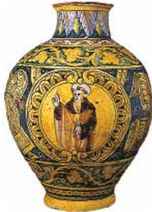
6 Palermo, Istituto Statale d'arte, Oval vase, majolica, early 17 th century, by Andrea Pantaleo