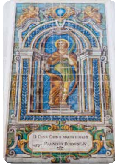
36 Marineo, Main church. Panel with St. Cyrus, early 18 th century, made in Palermo