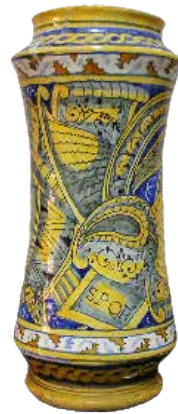
7 Palermo, Galleria di Palazzo Abatellis. Albarelo, majolica, early 17 th century, by Giroloamo Lazzaro