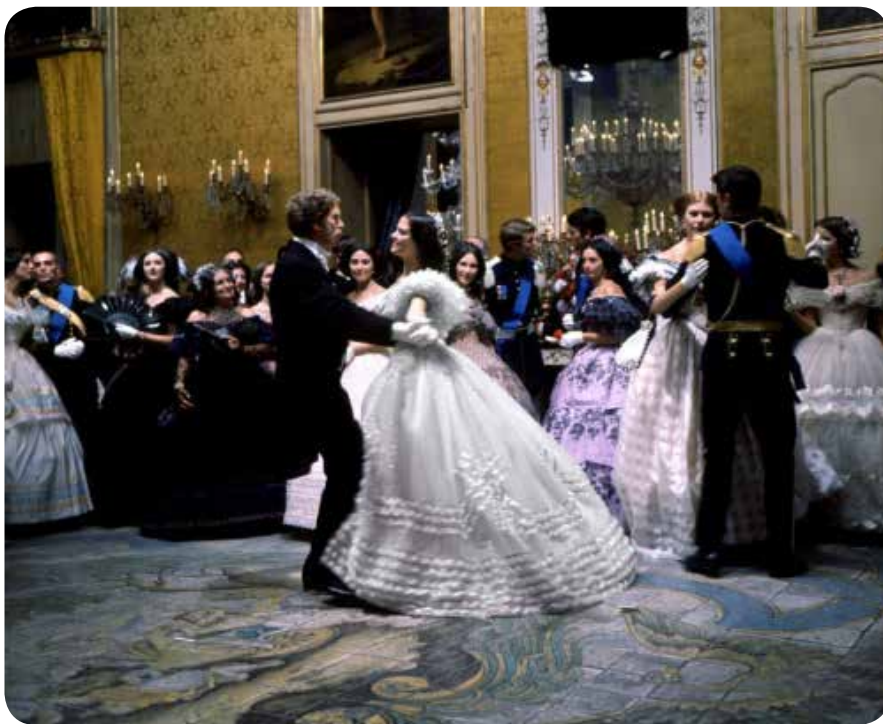
29 Ballroom scene from 'Il Gattopardo' by Luchino Visconti