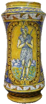
5 Palermo, Galleria di Palazzo Abatellis. Albarelo, majolica, early 17 th century, by Giroloamo Lazzaro

Ignazio Florio revived this rich artistic tradition by founding a factory specialising in the Art-Nouveau style, which quickly spread throughout Sicily and mainland Italy ( fig. 11 ). The factory was taken over by the Florentine Richard-Ginori some years after Florio's death.