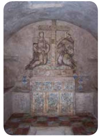
38 Palermo, Church of the Repentite, Altar in the crypt, 18 th century, made in Palermo