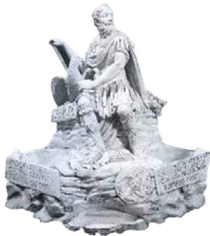
3 Palermo, Galleria di Palazzo Abatellis. Earthenware inkstand, early 19 th century, factory of Baron Malvica