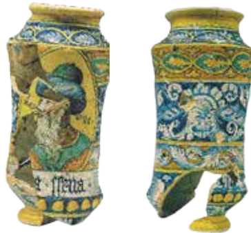
50 Albarello depicting doctor Mesuè, 16 th century, from Faenza