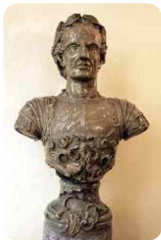
52 Busts, majolica, early 19 th century, factory of Baron Malvica