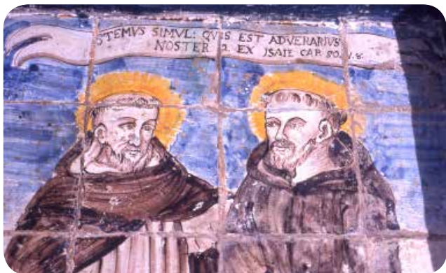
15 Petralia Sottana, Capuchin Convent. Panel depicting St. Francis and St. Dominic, 18 th century