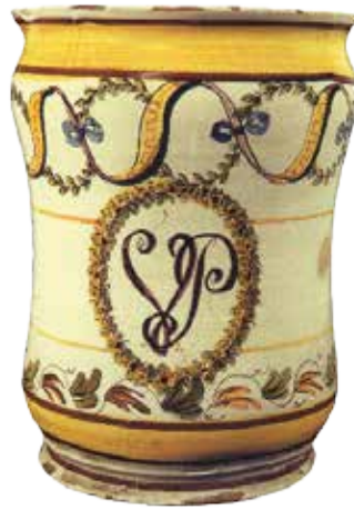
9 Palermo, Galleria di Palazzo Abatellis. Albarello, majolica, 1807, factory of Baron Malvica