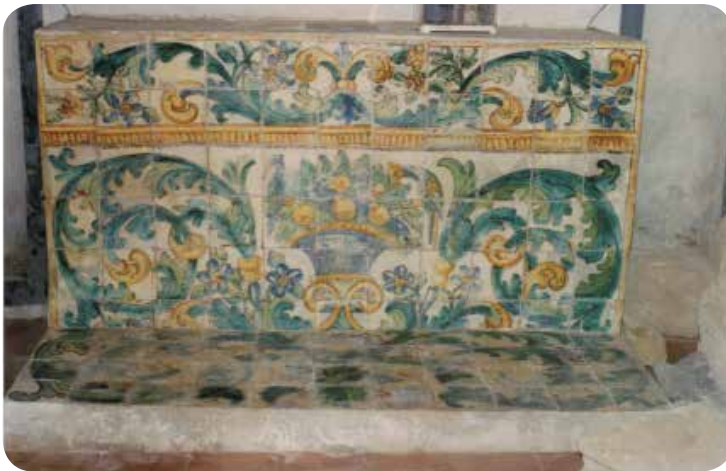
37 Palermo, Theological Faculty. Altar in the crypt of Santa Barbara, early 18 th century, made in Palermo