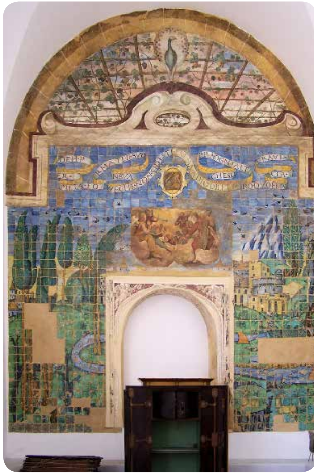
1 Palermo, Vignicella (now psychiatric hospital). Majolica panel, late 16 th century, Ligurian