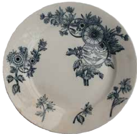
11 Private collection. Plate, earthenware early 19 th century, Florio factory