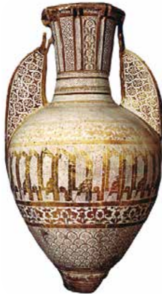
45 Vase, earthenware, early 19 th century, factory of Baron Malvica