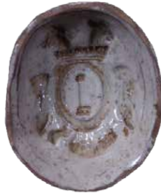
48 pudding mold with the armorial bearings of the Colonna family, early 19 th century, from Caltagirone

moulds depict rural landscapes, whilst the third bears the arms of the Colonna family ( fig. 48 ). An oval vase is the only example of 17 th century Palermitan manufacture, copied from models from Faenza and Casteldurante. It is decorated a trofei , i.e., covered in arms, drums, inscriptions, anthropomorphic and zoomorphic figures, with a central medallion depicting the Virgin Immaculate. An albarello is one of the last items to be produced in the workshops of Trapani in the 18 th century simply decorated with vegetable scrolls and a central medallion featuring the bust, outlined in blue, of a man in contemporary costume. This interesting nucleus of majolica is completed by two large plates: one decorated with a stylised foliate motif around the edge and a lion at the centre, attributed to 17 th century Salernitan artisans; the other is a rare late 18 th century example from a Moroccan workshop in Fez, painted with geometric motifs, probably arrived in Sicily with a traveller, sometime during the 19 th century ( fig. 49 ). Today, exhibited in the Archaeological Museum are Medieval and Renaissance remains found during the excavations in the city. These include Renaissance ceramics from the parishes of San Pietro and from Palazzo Steri ( fig. 50 ).