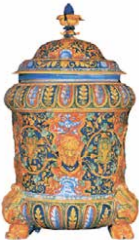
2 Palermo, Galleria di Palazzo Abatellis. Majolica vase with lid, by Francesco Mezzarisa, 1558