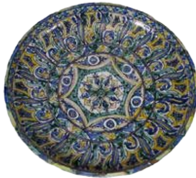
49 Dish, majolica, late 18 th century, made in Fez, Morocco