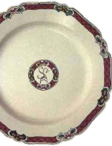
8 Palermo, Galleria di Palazzo Abatellis. Dish, majolica, 1765-1770, Factory of the Duca Oneto di Sperlinga