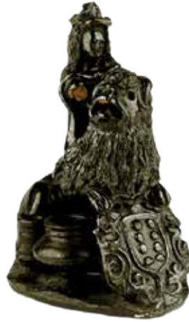
64 Inkpot, glazed terracotta, 17 th century, made in Collesano