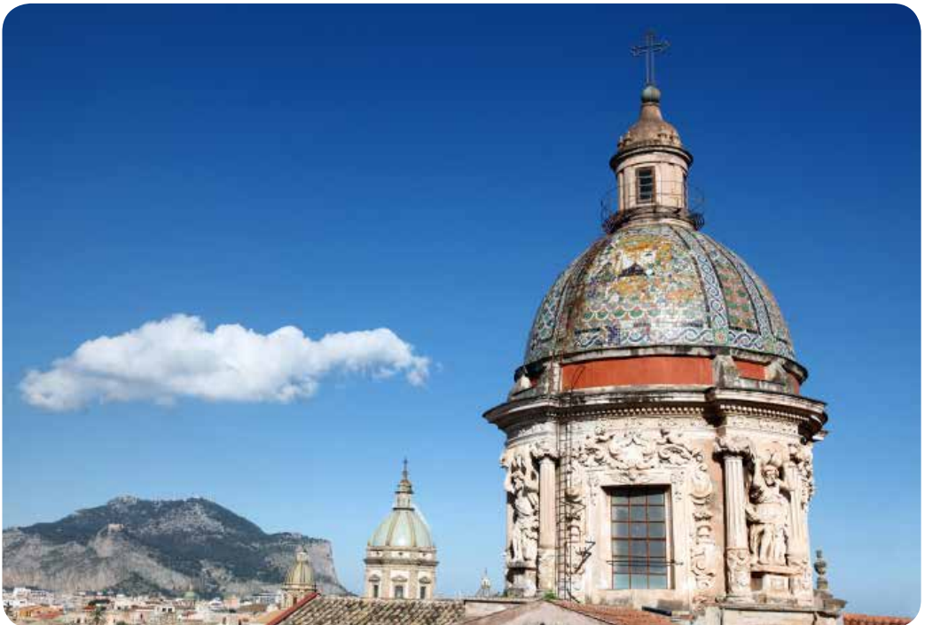
23 Palermo, Church of Carmine Maggiore. Dome