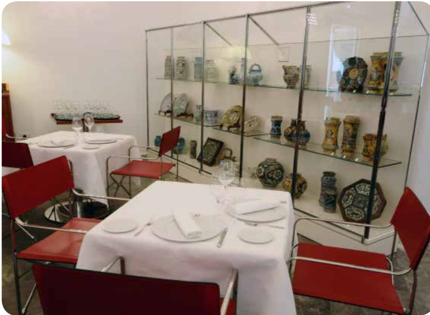
77 Collection of majolica and ceramics

after in Sicily, to the extent of still being copied by workshops in Caltagirone in the 18 th century. Of particular importance are a group of apothecary vases from Faenza and a series of show plates from the Italian workshops: Deruta, Urbino, Pesaro ( fig. 76 ). The collection also includes several Spanish majolica, Islamic and Chinese