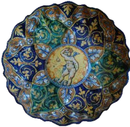
76 Cup, mid-16 th century, from Faenza