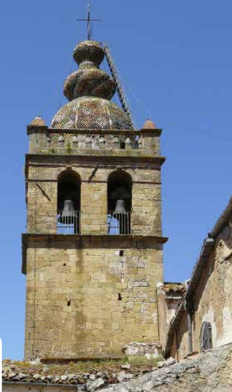
20 San Mauro Castelverde, Church of San Mauro. Pinnacle