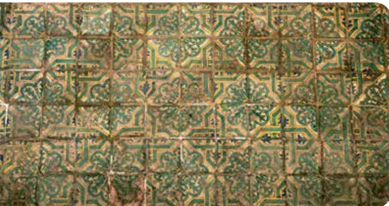
30 Palermo, Church of Santa Maria di Gesù. Fountain covered with tiles, late 16 th century