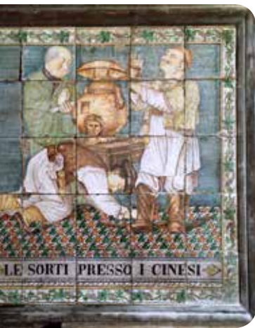
10 Palermo, Galleria di Palazzo Abatellis. Panel 'Fortune telling with the Chinese', majolica, late 19 th century, by Filippo Martinez