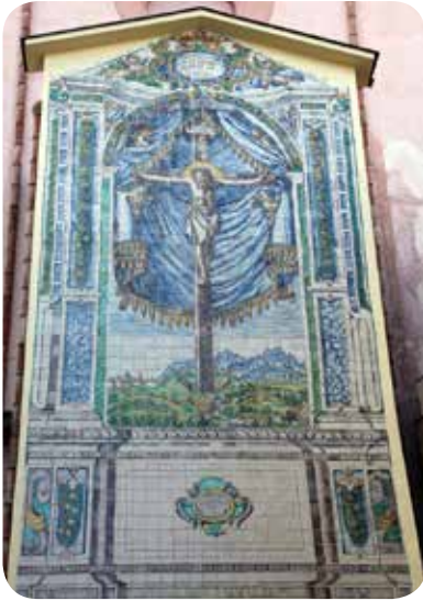
35 Monreale, church of the Collegiata. Panel, early 18 th century, made in Palermo