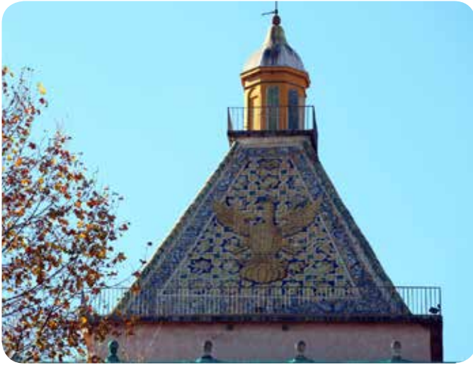
22 Palermo, Porta Nuova. Roof